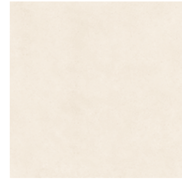
24 x 24 in / 61 x 61 cm Honed 5000-0213-0