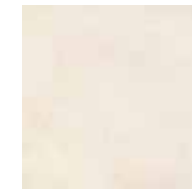
12 x 12 in / 30.5 x 30.5 cm Honed 5000-0207-0