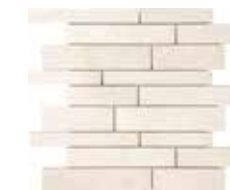
Random Strip Mosaic Honed 5001-0140-0