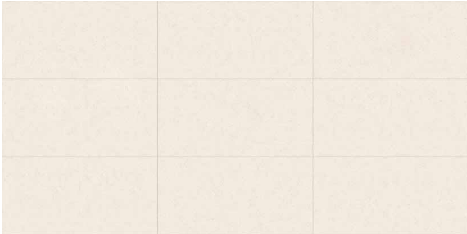
Serene Ivory Limestone (G)