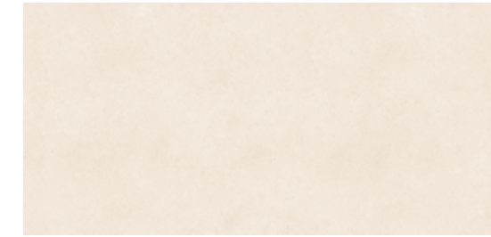
18 x 36 in / 45.7 x 91.4 cm Honed 5000-0211-2