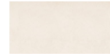
12 x 24 in / 30.5 x 61 cm Honed 5000-0209-0