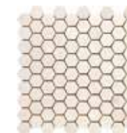
1.25 x 1.25 in / 3.2 x 3.2 cm Hexagon Mosaic Honed 5001-0132-0