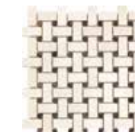
Basketweave Mosaic Honed 5001-0136-0