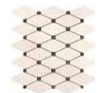
Clipped Diamond Mosaic Honed 5001-0138-0