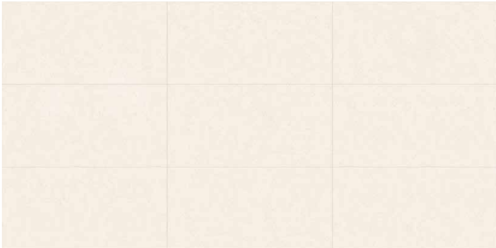
Serene Ivory Limestone (M)

12 x 24 in / 30.5 x 61 cm image variations