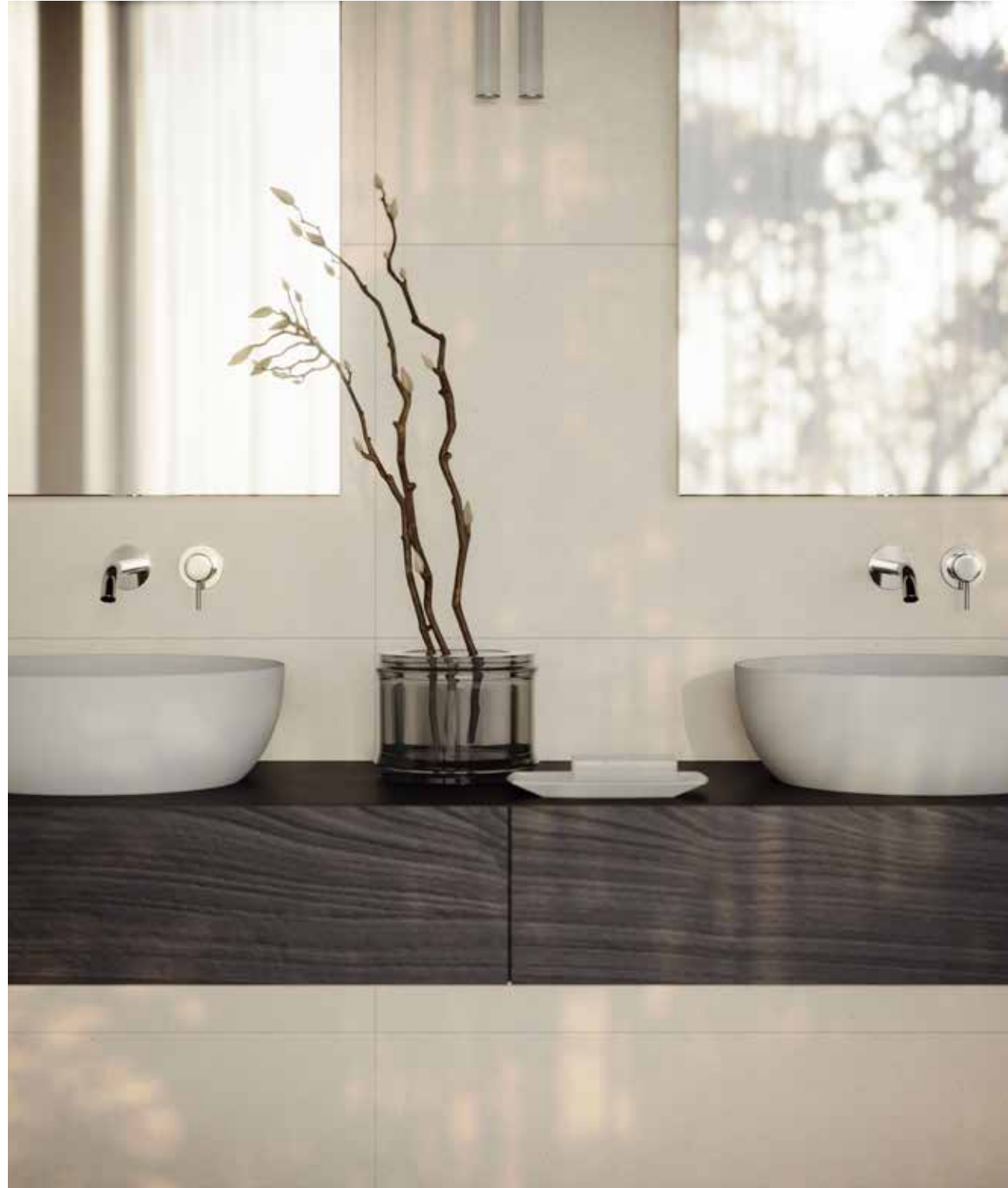
18 x 36 in / 45.7 x 91.4 cm Serene Ivory Polished Limestone Tile