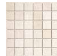
2 x 2 in / 5 x 5 cm Mosaic Honed 5001-0134-0